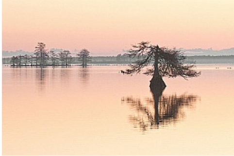
Sunrise on Lake Mattamuskeet

https://www.ncdcr.gov/about/history/division-historical-resources/nc-highway-historical-marker-program [2]