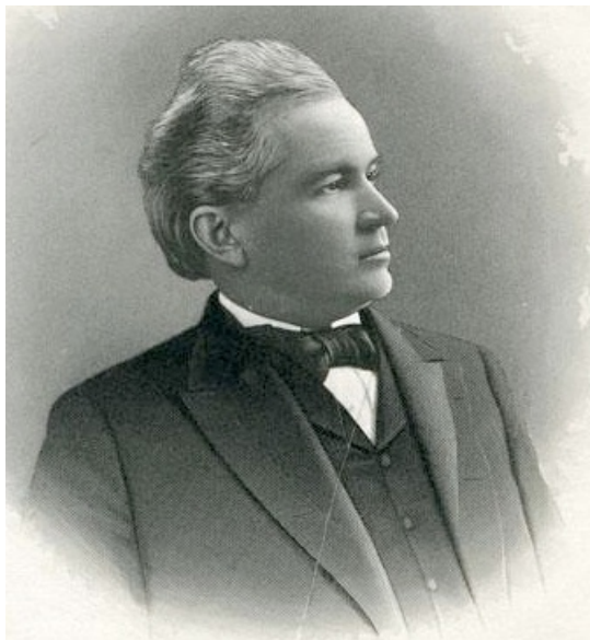
An engraving of Judge Henry Groves Connor.

Although Connor was a firm Democrat, in 1894 he was nominated for a position on the North Carolina Supreme Court [12] by the Populist party [13] . He later wrote that it was the aspiration of his life to serve on the court, but he refused to run as the candidate of the Populists and was so embarrassed by their nomination that he also declined to seek the support of his own party.