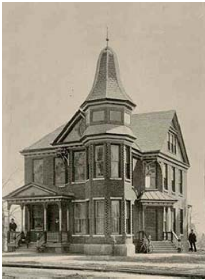
North Carolina Medical College at Davidson.

[20] North Carolina Medical College began in 1887 at Davidson College [21] as Davidson School of Medicine. The offering was originally a one-year preparatory course of study for students seeking admission to other medical schools. In 1893 the medical school incorporated and the course of study expanded to a three-year curriculum to train physicians. In 1902, the school added a year of clinical work at Presbyterian and Good Samaritan hospitals in Charlotte, thus expanding the program to four years. The entire medical school relocated to Charlotte in 1907 and was renamed the North Carolina Medical School.