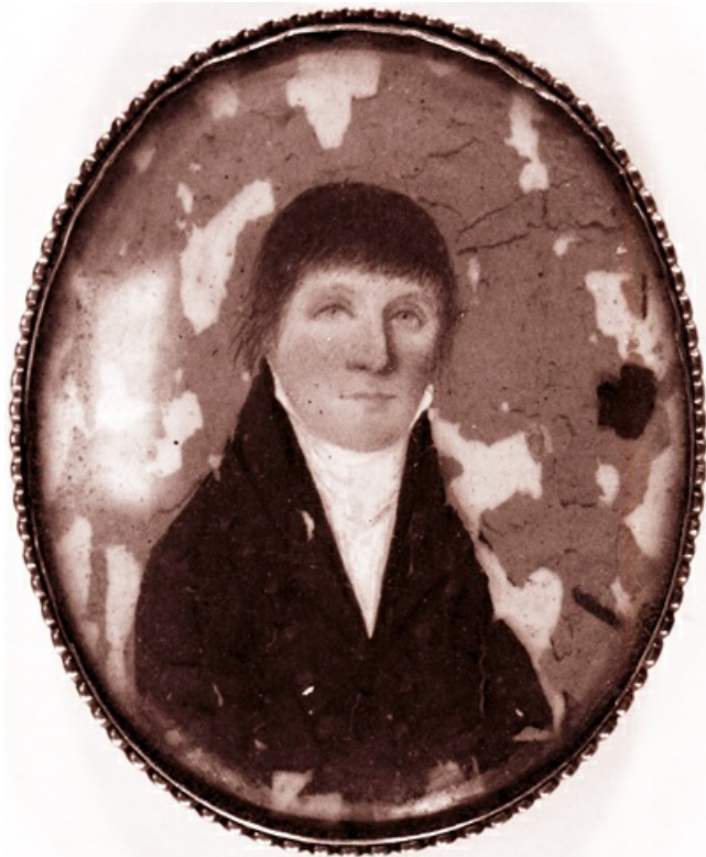
Photograph of a portrait believed to be Richard Caswell.

See also: Richard Caswell [2] , Research Branch, NC Office of Archives and History