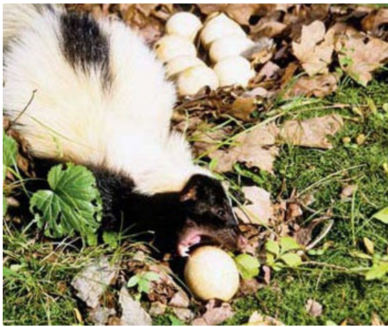
The skunks diet includes bird eggs.

Skunks live in areas with a mixture of woods, brush and open fields broken up by wooded ravines and rocky outcrops. They prefer timbered areas and pastures with good water sources. Skunks create dens by digging into slopes of hills and spend most of the day there.