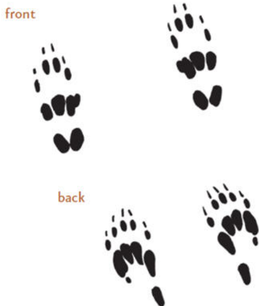
Fox squirrel tracks