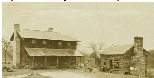
Home of Chang and Eng Bunker.

On the voyage across the Atlantic, Chang suffered a stroke and partial paralysis. He recovered partially, but from that time his health began to decline inexorably. It is remarkable that their families managed to endure the strain as well as they apparently did, considering the increasing severity and frequency of the twins' fights. On January 12, 1874, Chang was