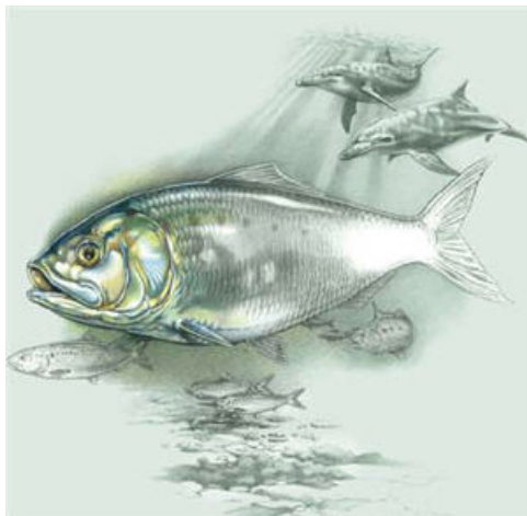
DescriptionColored drawing of American Shad

Every year, in an event that heralds the coming of spring, large numbers of American shad make their way up several of North Carolina's coastal rivers to their historic spawning grounds, where shad fishermen eagerly await their arrival. The American shad, commonly known as white shad in North Carolina, is a member of the Clupeidae, or herring family. The herring family is composed primarily of marine species and includes some of the most valuable food fish in the ocean. Hickory shad and river herring, as well as the American shad, are highly prized for their firm flesh and roe (fish eggs). In addition to being prized food fish, some, such as the river herring, thread-fin and gizzard shad, are also commercially important baitfishes.