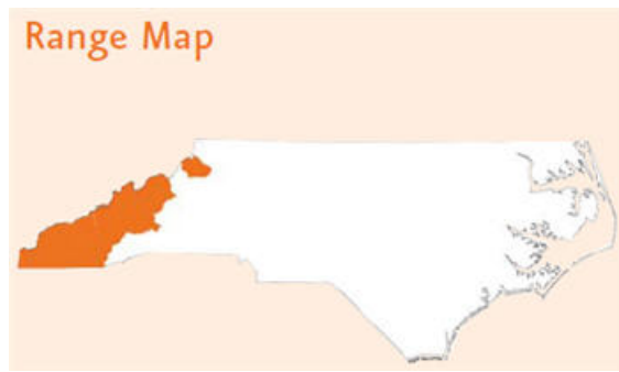
The tangerine darter can be found in the shaded Range and Distribution regions.

The tangerine darter is found only in the mountainous sections of the upper Tennessee River drainage. In the mid-Atlantic region, this includes western Virginia and western North Carolina. The darter also occurs in a small portion of northern Georgia and throughout eastern Tennessee. In North Carolina, the species is located in many counties [5] within the Appalachian mountain region [6] . Throughout its range, the tangerine darter’s distribution has been fragmented by reservoirs. Because of its restricted range, it is considered a species of conservation concern throughout its range, but it is common and abundant in many streams in western North Carolina.