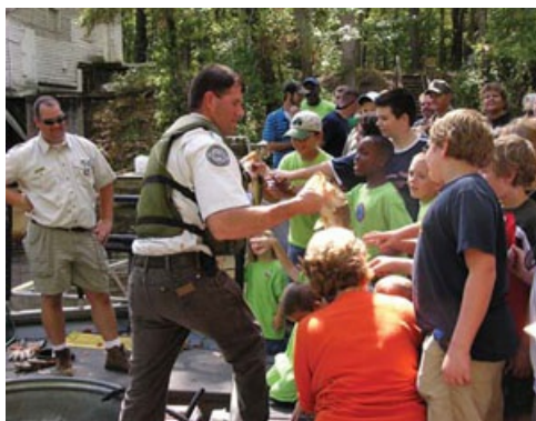
Biologists educate people about NCWRC Interaction Largemouth bass.

Largemouth bass have had a tremendous influence on many people. Tackle manufacturers, boat dealers and bait shops all provide specialized gear for largemouth bass fishing, especially for an increasing number of anglers involved in largemouth bass tournaments. Largemouth bass fishing is big business; many people make their livelihood from this popular sport. Although water pollution is a real threat to largemouth bass and other fish populations in some waters, the largemouth bass is an adaptable species and, overall, its future looks bright.