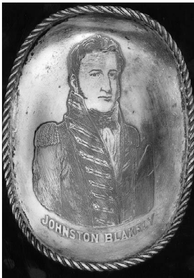
Engraving of Johnston Blakeley.