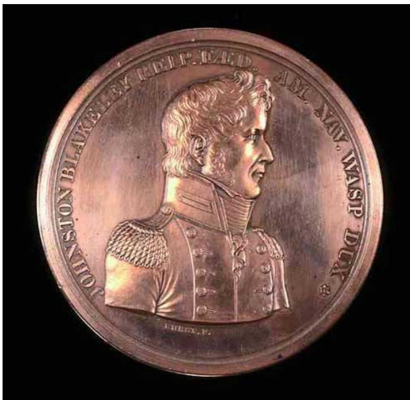
Commemorative Medal in honor of Johnstone Blakeley. North Carolina Museum of History.

S.C. John C. Calhoun heard a report that she was operating in the Pacific Ocean. Blakeley was promoted to post captain, but he and his men never returned.