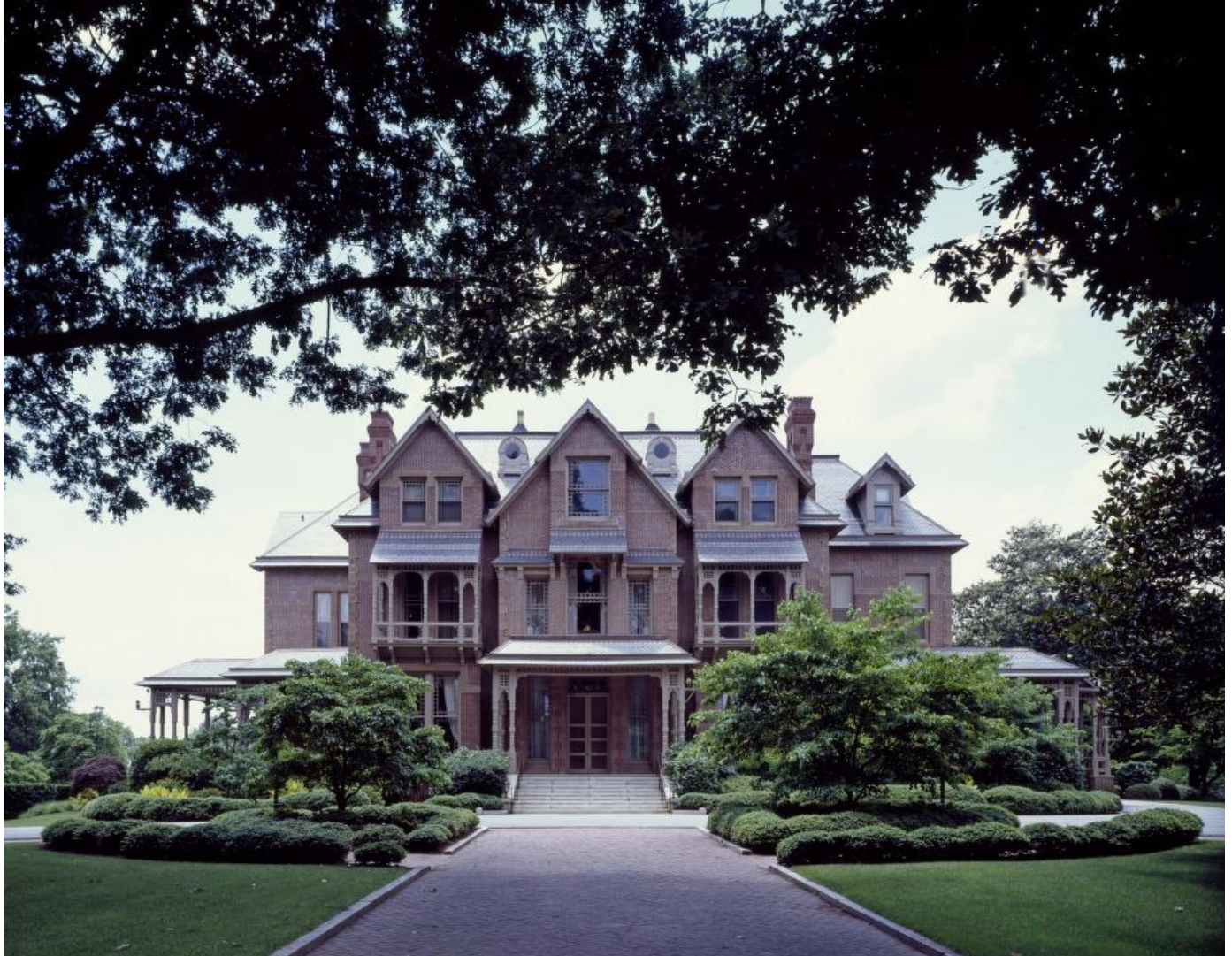
Governor's Mansion, Raleigh, North Carolina, ca. 1980.