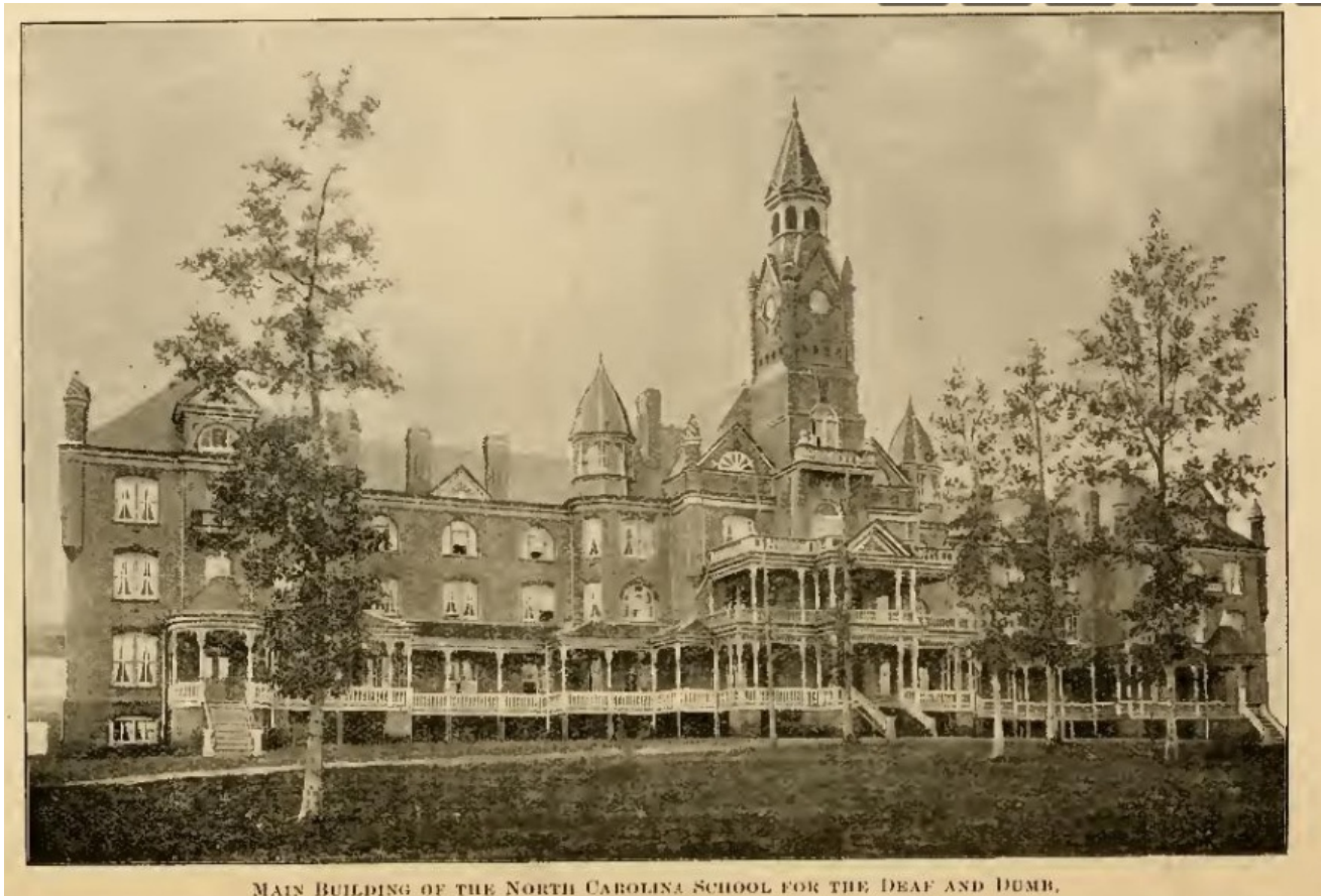
A photograph of the N.C. School for the Deaf and Dumb located in Morganton in 1896.