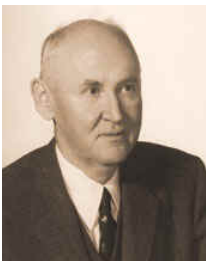
Portrait from the Battle, Winslow, Scott & Wiley lawfirm.