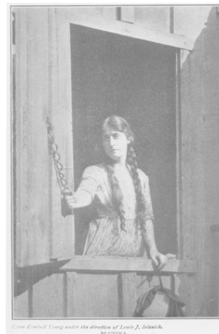
Image from Heart of the Blue Ridge (1915) motion picture.