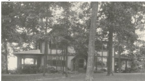
Frederick Fries Bahnson house at 28 Cascade Avenue, 1924.