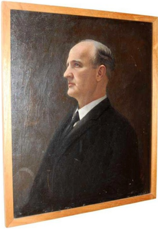
Portrait of Charles Brantley Aycock, circa 1900.

Under Aycock's leadership, the appropriations for the public schools and the state's colleges were increased, teaching standards were raised, state adoption of textbooks replaced the more expensive system of local adoption, 877 libraries were established in rural schools, and hundreds of schoolhouses were built. The enrollment of white children rose 11 percent, and the average length of the school term increased from seventy-three days to eighty-five days. Local expenditures for Negro schools did not increase at the same rate as expenditures for white schools, but the enrollment of Negro children rose 10 percent and the average length of the school term increased from sixty-three days to eighty days. Teachers organized into associations for the promotion of their profession, teacher pay went up, and compensation for county superintendents doubled. Local school taxes were being collected in 229 districts in 1904, compared to 30 in 1900. In the same period, 37 new municipal graded schools were established. On the basis of the amount of money spent for public education as a percentage of wealth, North Carolina moved in rank among the states from thirty-second in 1900 to twenty-first in 1904.