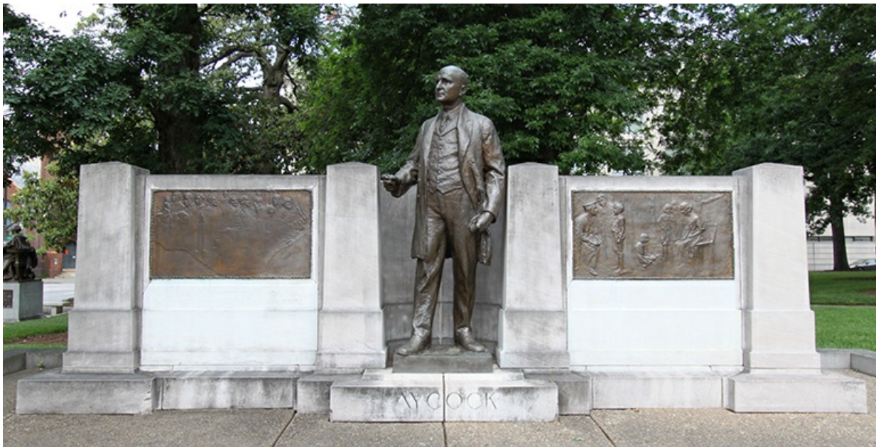
Photograph of the Charles Brantley Aycock memorial at the Capitol Building in Raleigh, 2011. Image from Flickr user OZinOH. [33]