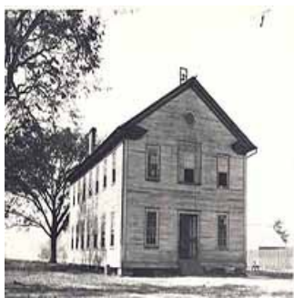
[4] Fayetteville State