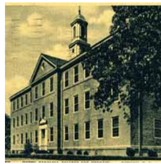
[14] North Carolina Central