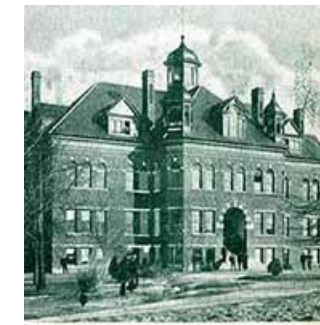
[11] North Carolina A&T