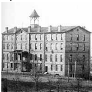
[7] St. Augustine's