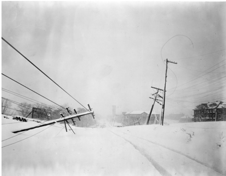
Snow Storm, April 2-3, 1915, Hillsborough Road, near A&M College, Raleigh, NC. From Carolina Power and Light Photograph Collection, North Carolina State Archives, call #: PhC68_1_490_1.