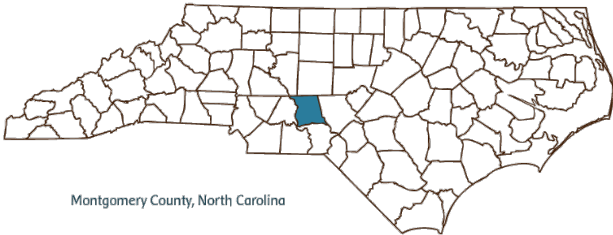
Montgomery County, North Carolina

See also: North Carolina Counties [15] (to access links to NCpedia articles for all 100 counties)