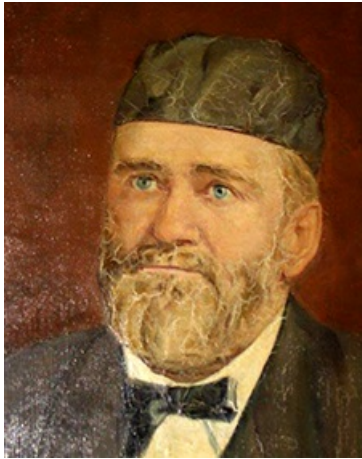
Portrait of William Laurence Saunders.

[4] When William Laurence Saunders [5] took office as North Carolina's secretary of state [6] in 1879 and found a cache of neglected colonial documents in the old arsenal on Capitol Square, he prepared a report that detailed the wretched condition of the public records and proposed gathering the surviving papers and putting selected ones into print. However, remembering the earlier appeals of Swain and Wheeler to procure copies of the colony's records preserved in London, he soon broadened his proposal. Consequently, the General Assembly [7] of 1883 gave him complete discretion to copy and print those records that he judged important. An agent was hired to supervise the copying of records in London, and within five years about 15,000 pages of transcripts had been received. Ten volumes of The Colonial Records of North Carolina [8] were printed at state expense under Saunders's editorship from 1886 to 1890. The 10,982 printed pages of documents dating from 1622 through 1776 constituted the most monumental and significant historical enterprise in the state to that time.