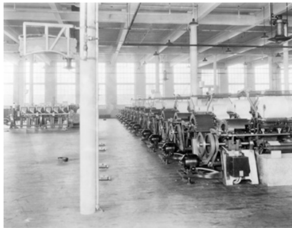
Interior, Crawford Mill, c.1920, Lincolnton, NC.

Textiles- Part 4: Decline, Consolidation, and the Future of Textiles in the State [19]