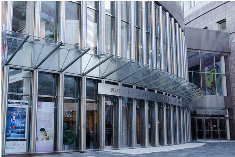
Blumenthal Performing Arts Center in Charlotte, NC, 2012.