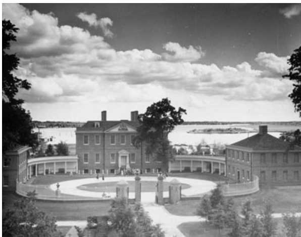
Tryon Palace, c.1963, New Bern, NC. Elevated View. From Carolina Power and Light Photograph Collection, North Carolina State Archives, call #: PhC68_1_60_2.