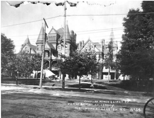
Baptist University for Women (Meredith College), downtown Raleigh, NC, 1909.