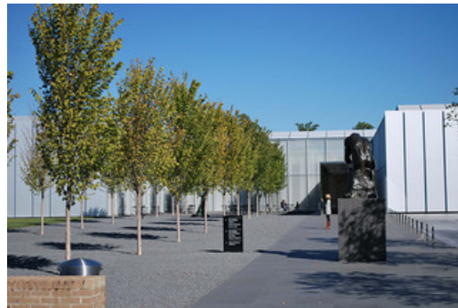
North Carolina Museum of Art. Image

Part i: Introduction [13] ; Part ii: Early North Carolina Painting and Portraiture [14] ; Part iii: A Growing Artistic Community in the State [15] ; Part iv: Producing and Teaching Art in North Carolina Colleges and Universities [16] ; Part v: The Evolution of Photography [17] ; Part vi: North Carolina Art Museums, Exhibits, and Centers