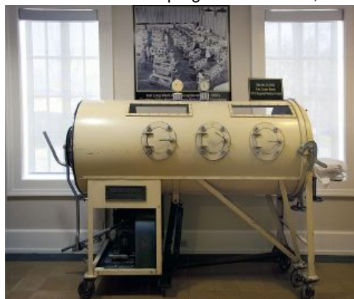
"Iron lung (c. 1933) used to "breathe" for polio patients until 1955."

Polio epidemics, occurring especially in the summer, struck terror into the hearts of American parents during the first half of the twentieth century. In 1948, an especially bad year for North Carolina, 2,516 cases and 143 deaths were reported. A special emergency polio hospital was set up in the Greensboro [20] area since Guilford [21] was the hardest hit county in the state. The National Foundation for Infantile Paralysis, whose annual fund-raising effort is called the " March of Dimes [22]," was founded on 3 Jan. 1938 to help finance a nationwide campaign of education, research, and relief for victims of