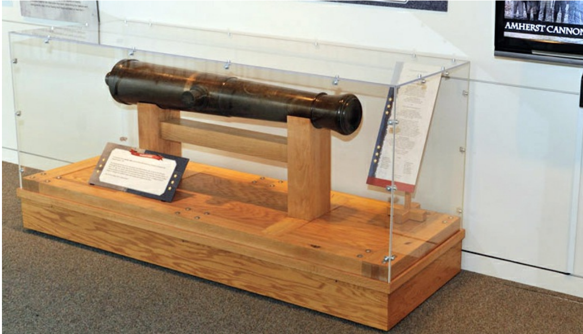
The Amherst Cannon on display at the North Carolina Museum of History, 2012.

The six-pounder bronze cannon tube is on exhibit at the North Carolina Museum of History [8] in Raleigh until June 2015.