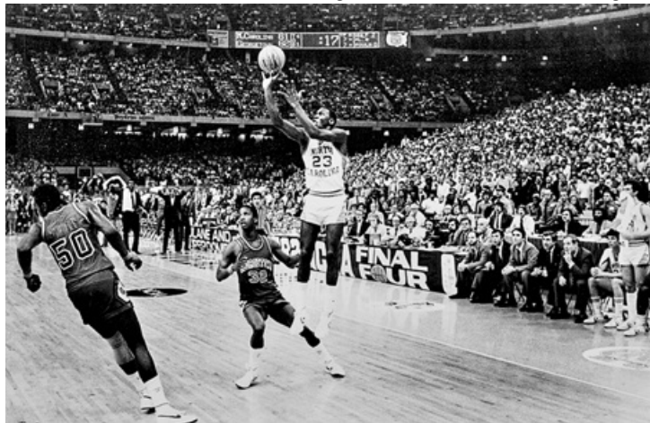
Michael Jordan, as a UNC freshman, launches the winning shot against the Georgetown Hoyas in the 1982 NCAA championship game in New Orleans. Raleigh

professional basketball grows longer by the year. News and Observer.