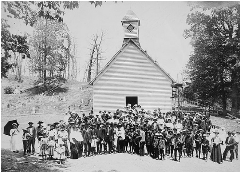
Pisgah church May 30, 1909

[24] The character and style of North Carolina's Protestantism was primarily evangelical. Evangelical faith emphasized biblical authority, commitment to proselytizing, sympathy for revivals, suspicion of liturgical formalism (such as in Roman Catholicism [17] ), and a subjective assurance of personal conversion-having been "born again" in Christ. Most Christian groups adhered to these beliefs, although some Quakers [15] and Moravians [12] , and a few Baptists [2] , Presbyterians [25] , Lutherans [10] , and Episcopalians [26] , resisted. Each denomination of Christians created periodicals, schools, colleges, and networks of churches, so that by the Civil War, although there were different kinds of Protestants, evangelical values dominated formal as well as informal religion and exercised considerable cultural influence beyond the churches.