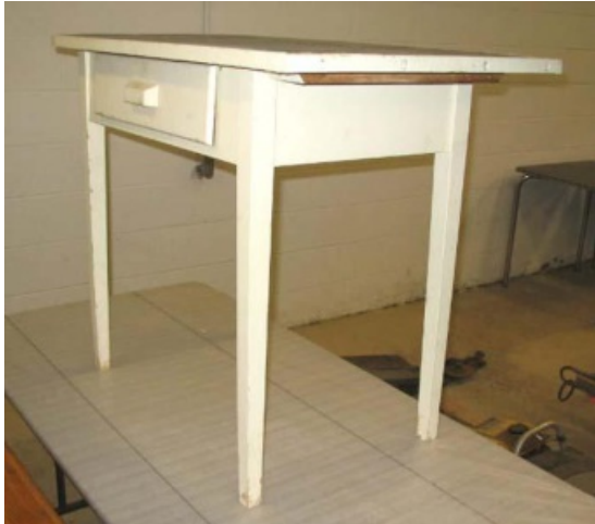
Small white-painted rectangular wooden utility table, 1880-1950. Mount Airy, North Carolina

By 1900 there were 44 furniture factories in High Point and the surrounding towns of Thomasville, Lexington, Salem, Marion, Mount Airy, Statesville, Hickory, and Greensboro. The central location of the Piedmont made High Point a natural shipping point for southern markets that desired inexpensive, well-made furniture. The industry was also given a boost when several national mail-order companies, including Sears, Roebuck & Co [20] , purchased large lots of North Carolina furniture to market nationwide through their catalogs. Other allied manufacturers set up factories in High Point to provide veneers, plate glass, mirrors, paint, and locks to the furniture companies.