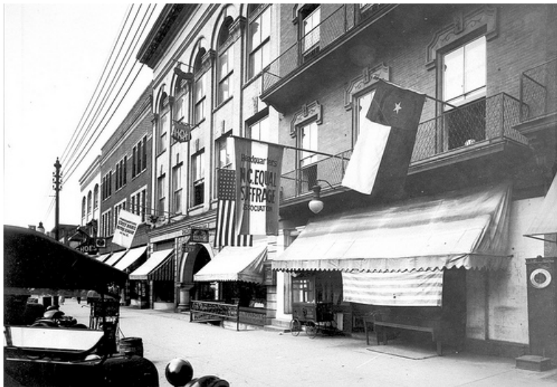
"Womans Suffrage Headquarters of the North Carolina Equal Suffrage Association, Raleigh, NC, c.1910's-'20's."

Part 1: Introduction [7] ; Part 2: Women's Roles in Precolonial and Colonial North Carolina [8] ; Part 3: Women in the Revolutionary Era and Early Statehood [9] ; Part 4: Life in Antebellum North Carolina [10] ; Part 5: Secession and Civil War [11] ; Part 6: Women Help Shape the New South [12] ; Part 7: Women Earn the Right to Vote [13] ; Part 8: Activism and the Expansion of Women's Opportunities and Public Influence [13] ; Part 9: References [14]