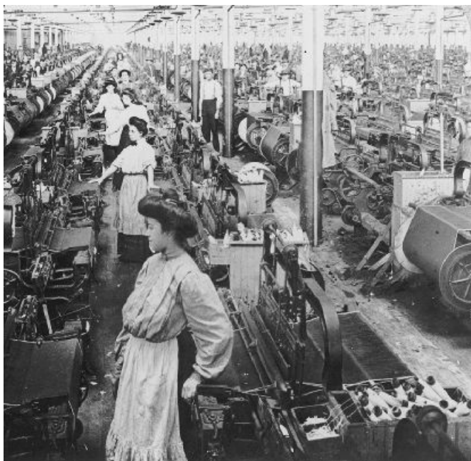
"Men and women weaving at the White Oak Mill in Greensboro, NC, 1909."

Part 1: Introduction [7] ; Part 2: Women's Roles in Precolonial and Colonial North Carolina [8] ; Part 3: Women in the Revolutionary Era and Early Statehood [9] ; Part 4: Life in Antebellum North Carolina [10] ; Part 5: Secession and Civil War [11] ; Part 6: Women Help Shape the New South [11] ; Part 7: Women Earn the Right to Vote [12] ; Part 8: Activism and the Expansion of Women's Opportunities and Public Influence [13] ; Part 9: References [14]