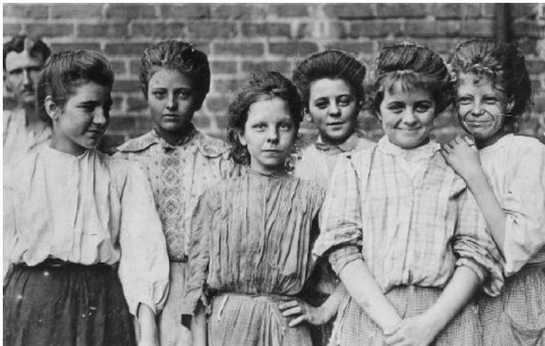
Girls enjoying a break from work, outside a Georgia cotton mill.

Discontented black and white farm families joined Republicans and agrarian reformers in the Farmers' Alliance [21] and Populist Party [22] in the 1880s and 1890s to challenge entrenched political and business interests in North Carolina that controlled industry and farm prices. About 25,000 women joined the Farmers' Alliance in the state. They pressed for reforms such as the establishment and funding of public schools and colleges for black and white women with some success. White supremacy campaigns launched by the Democrats in 1898 and 1900 limited interracial cooperation, however, until the end of Jim Crow laws, disfranchisement, and segregation [23] in the 1950s and 1960s.