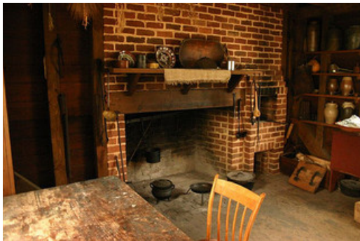
Kitchen Shack Interior- Historic Latta Plantation.