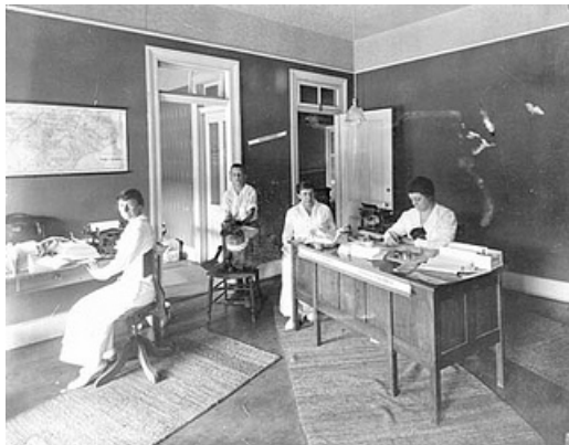
"A Headquarters of the Equal Suffrage Association." Raleigh, NC, c.1910's.

[20] From Virginia Dare [21] 's birth on Roanoke Island in 1587 to Elizabeth Dole [22] 's election as a U.S. senator in 2002, many North Carolina women have been leaders or participants in important historical events and trends. Countless others-of all races-have lived, worked, and shaped their homes and communities in relative obscurity. Written histories of North Carolina have often focused on topics relating to the work and accomplishments of men, and even in the early 2000s North Carolina women remained marginalized in many ways. Large numbers worked in low-skill jobs in a time of increasing demand for a technologically advanced workforce. Equity of pay for women and men remained an issue. The number of female-headed households continued to increase, while many of the women heading households had low-paying jobs and children to support. At the same time, North Carolina women of ability and energy, regardless of race or class, have enhanced women's opportunities in politics, the arts, and the professions.