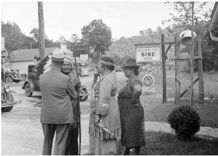
Qualla Boundary, 1939

[10] In 1924 the Eastern Band of Cherokee Indians and the federal government agreed to put Cherokee tribal lands in trust. As a result, North Carolina state law did not apply to Cherokee lands within the Qualla Boundary [11] . While most Indian reservations were carved out of existing federal property and set aside for individual tribes, the federal government never owned the lands comprising the Qualla Boundary in North Carolina.