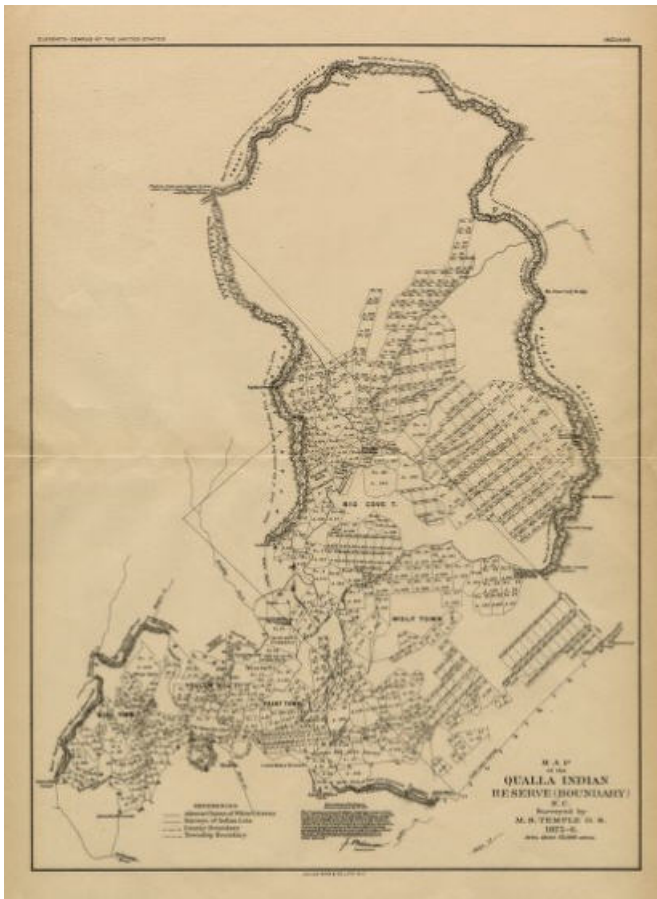
1890 Census map of the Qualla Boundary from the NC Maps collection.

[15] Scott to round up Cherokees in North Carolina, Tennessee, Georgia, and Alabama and place them in various internment camps and stockades. The horrible conditions facing his people at these poorly planned facilities led Ross to appeal to the president for a delay in the removal until fall, when water and game would be more plentiful. Van Buren agreed, and between October 1838 and March 1839, the Cherokee moved west. The journey was mismanaged; there was a shortage of supplies; and the troops rushed the Indians onward, refusing to allow them to minister to their sick or bury their dead. Of the approximately 15,000 who began the trek, an estimated 4,000 perished.