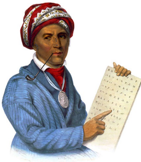
19th Century portrait of Sequoyah with the Cherokee syllabary

independence to white North Carolinians, the region's Indians, including the Cherokee, were a conquered people. Nevertheless, the Cherokee managed to maintain a semblance of political independence and cultural integrity despite military defeat. With the Treaty of Holston (1791), the United States initiated a "civilization" program aimed at assimilating the Cherokee people into the mainstream of American society. To a great extent this meant the adoption of sedentary agriculture. Consequently, with Indians living by means of farming, their huge hunting grounds would no longer be needed and whites could easily acquire more Cherokee land. The Tellico Treaty [13] was signed in 1798 as a result of the movement of settlers into Cherokee territory in western North Carolina, west of the 1791 Holston Treaty line. The Tellico Treaty specified that a line, called the Meigs-Freeman Line [14] , was to be drawn from the "Great Iron" or "Smokey" mountain in a southeasterly direction so as to exclude settlers from Cherokee territory. War Department agent Return Jonathan Meigs supervised the running and Thomas Freeman the surveying of the line from July through October 1802. They were assisted by Cherokee leaders and settlers. The line ran from the peak of Mount Collins (located between Clingman's Dome and Newfound Gap) to a point on the North Carolina-South Carolina border near the southwestern corner of Transylvania County [15] .