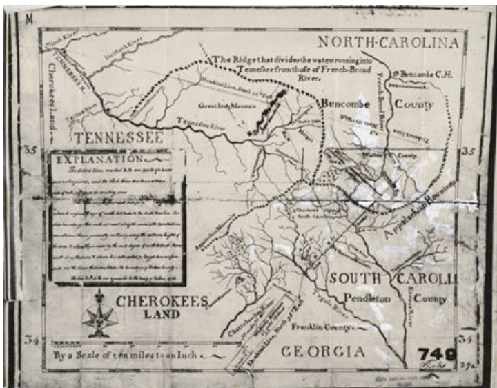
Cherokee Land 1804

[12] While the American Revolution brought