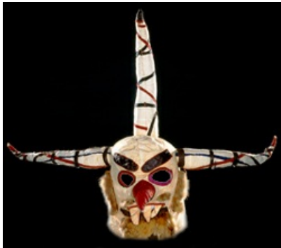
"Ku Klux Klan mask from the Reconstruction Era - North Carolina Museum of History."

Part i: Introduction [6] ; Part ii: The Fourteenth Amendment and the Beginning of Congressional Reconstruction [7] ; Part iii: Statewide Changes and Achievements during Reconstruction [8] ; Part iv: The End of Reconstruction and the Return of Democratic Control ; Part v: References [9]