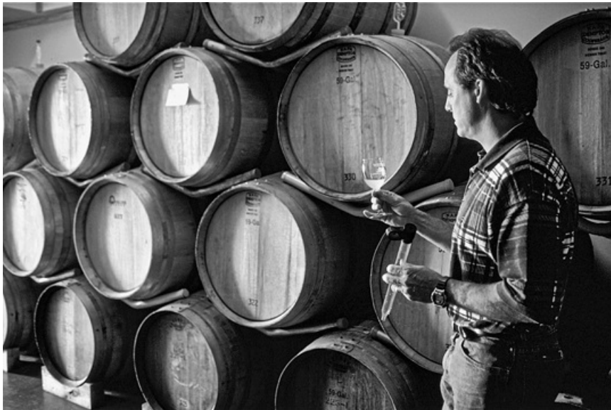
Sampling wine at Westbend Vineyards near Winston-Salem.