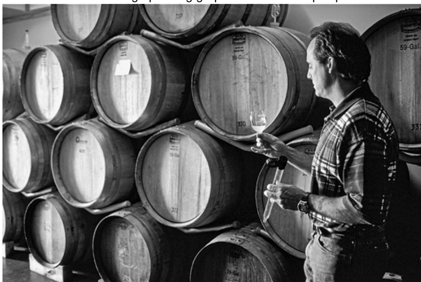
Sampling wine at Westbend Vineyards near Winston-Salem.