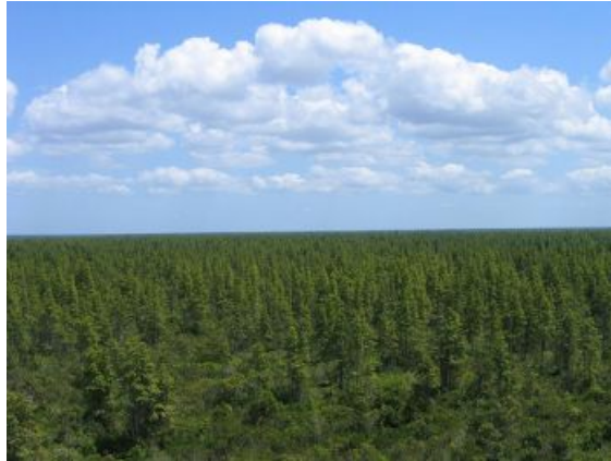
"Healthy pocosin wetlands". Image courtesy of U.S.

See also: Great Dismal Swamp [2] ; Pocosins [3] ; Swamps [4] . Fish and Wildlife Service, 2012.