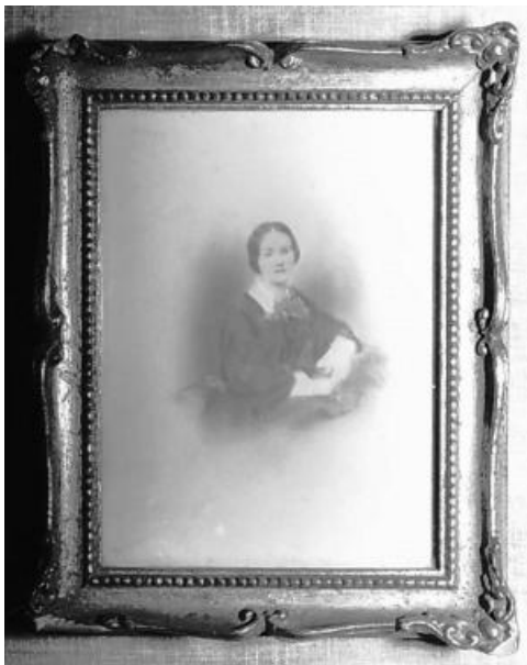
Portrait of Harriet Espy (Hattie) Vance.