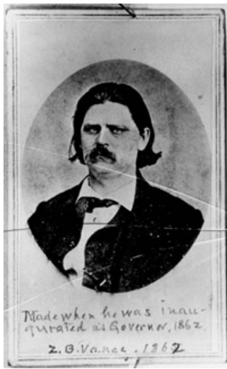
Portrait Zebulon Vance. Made when Vance was inaugurated Governor of NC, 1862.