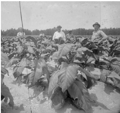
Group in tobacco field, no date (c.1920's-'30's).

Tobacco- Part 1: Introduction ; Tobacco- Part 2: Development and Growth of the North Carolina Tobacco Industry [12] ; Tobacco- Part 3: The Rise of "Big Tobacco" [13] ; Tobacco- Part 4: Legal Challenges and the Decline of the Industry [14] ; Tobacco- Part 5: References [15]