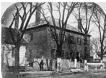
New Bern Jail, Craven St., New Bern, NC, c.1864 (copied from the North Carolina Collection, UNC-CH).

Queen Anne did in fact see her country as the protector of European Protestantism and looked favorably upon the idea of providing aid to the impoverished German emigrants, many, though not all, of whom were Protestants. Her intent coincided with the need of the Proprietors [12] of Carolina and Pennsylvania for settlers. By 1709, as suffering increased in Germany, 1,000 refugees a week began making their way up the Rhine River and over to England. Within a short time, London was crowded with homeless refugees who lived in tents along the banks of the Thames River [13] . Colonization was seen as one solution to the problem.