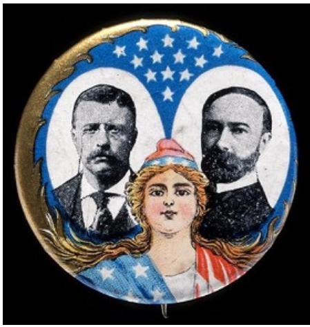
Button for the 1904 Roosevelt/Fairbanks Republican presidential campaign.

Cracks in the Democratic one-party domination of twentieth-century North Carolina politics did not appear again until the 1920s, when some Republicans began to portray themselves successfully as the "lily-white" party. Republicans carried the state in the 1928 presidential election, as many Democrats opposed Al Smith's candidacy, which they dubbed "rum and Romanism" in reference to his anti-Prohibition views and Catholic faith. That year Charles A. Jonas became the first Republican elected to Congress from North Carolina (his son Charles R. Jonas became the second Republican congressman in 1952 and was reelected to nine successive terms). Dwight D. Eisenhower's popularity in the state in his 1952 and 1956 presidential runs were further examples of Republican success during this era.