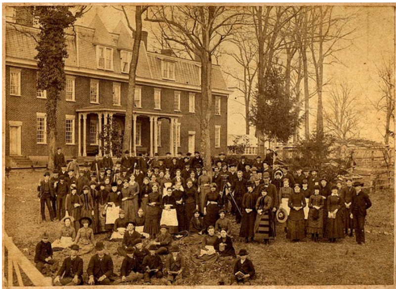
Faculty and staff, New Garden Boarding School, 1886.

North Carolina Friends entered a century-long period of decline during the civil strife that began with the War of the Regulation and continued into the American Revolution [14] . The pacifist Quakers were particularly affected by the military operations and the protracted violence of the internal conflict between the Whigs and Loyalists. The key factor, however, in the diaspora of southern Quakers was their witness against slavery, which began in the late eighteenth century and intensified in the nineteenth century. Quakers organized manumission and African colonization societies and gradually began to advocate abolition of slavery. Levi Coffin [4] of Guilford County was a founder of the Underground Railroad [15] , which enabled thousands of slaves to escape to freedom. The southern community met the Quaker antislavery stance with escalating hostility, precipitating mass migrations of Quakers to the free states of Ohio and Indiana.