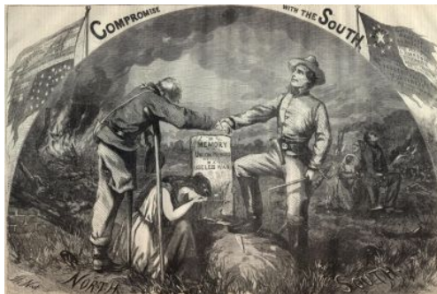
"Peace Poster. " Harpers Weekly, Part 1: Introduction September 3, 1864. [12]

Various peace movements that occurred in the North and South during the Civil War [4] had a strong impact on the political climate of both sections. In the Confederacy [13] , North Carolina produced the largest and most aggressive peace movement, which developed in three phases: a protest against the state draft in March 1862, the establishment of the Peace Party in the summer of 1863, and a convention movement in 1864.