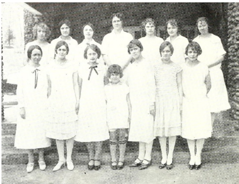
Normal and College Graduating Class, The Sun Dial , 1926.

[2] Montreat College, located 15 miles east of Asheville [3] in Montreat, began in 1916 as Montreat Normal School, an institution founded by the Presbyterian Church [4] (USA) to prepare young women to become Christian teachers. In 1933 the school was renamed Montreat College and became a junior college for women, and from 1945 to 1959 it was a four-year college for women. In 1959 Montreat became coeducational. In 1986, responding to both the needs of its students and the needs of the church at large, the college began offering baccalaureate degrees in human services and liberal arts.