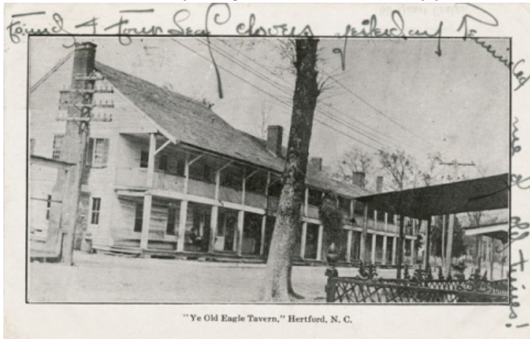
Postcard of "Ye Old Eagle Tavern," Hertford, N.C. Image from the the twentieth century. [22]

Pop Castle was a legendary inn and recreation center in colonial Granville County [15] at a site now in Vance County [16], one mile west of Kittrell. It was reputedly first occupied by an unidentified nobleman, a political refugee from Europe, and later owned by one Captain (Nathaniel?) Pope, a pirate [17] who was said to have buried gold [18] nearby. Known for a time as Popcastle Inn, it was soon altered to Pop Castle by local usage after an adjoining cockfighting pit and tavern began to attract people. A racetrack [19] was laid out during the Revolution [20]. The main building of the inn was finally taken down after the Civil War [21]. The site was marked by a large lone oak tree for many years, but myths of Pop Castle survived into