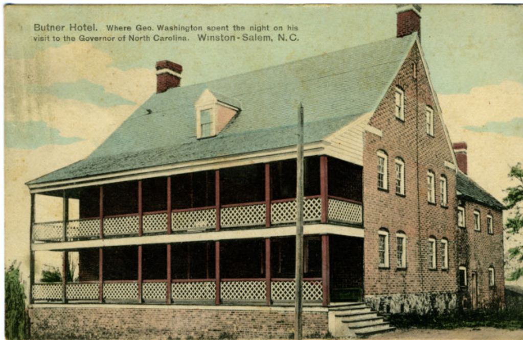
Postcard of the Salem Tavern (then called the Butner Hotel), circa 1908. -Salem, N.C.

See also: Salem Tavern [2] ; Travelers' Rooms [3] .