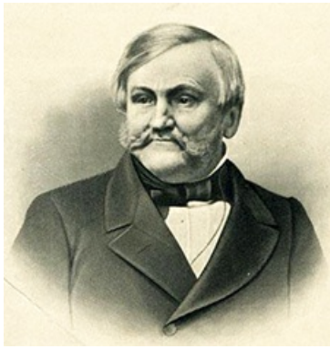
Lithograph print of John H. Wheeler. Image from the North Carolina Museum of History.