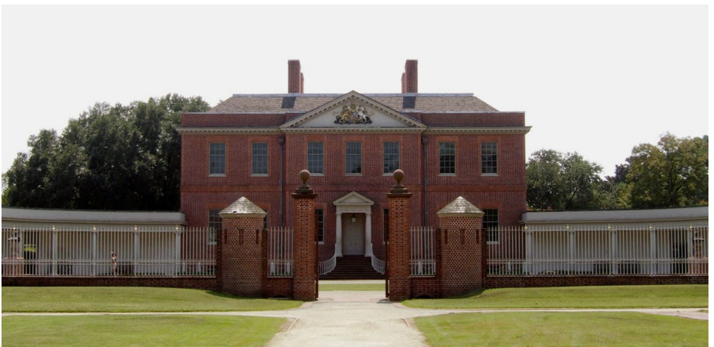
Fort Johnston